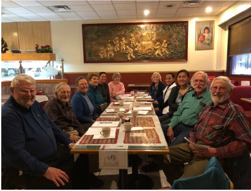
WCFH Board of Directors enjoys chai at monthly meetings.

WCFH Board of Directors meets at 4:00 p.m. on the third Monday of every month at Guru's Restaurant. The January meeting was a full house with several guests attending.