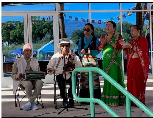
Sherpa and Nepali friends perform a short music and dancing program at Culture Fest.