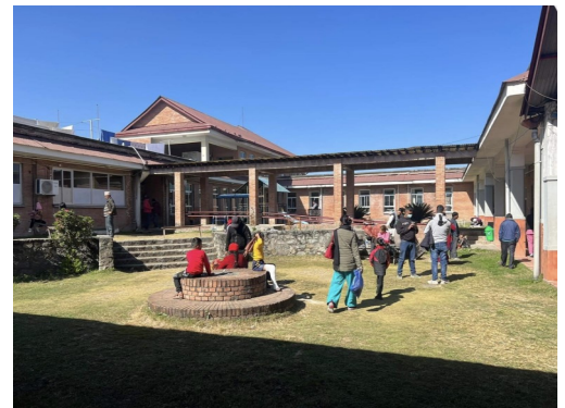
The Hospital and Rehabilitation center in Banepa, Nepal has a long waiting list.

The Hospital and Rehabilitation Center for Disabled Children in Banepa provides skilled surgical procedures to give severely handicapped children a positive chance at a normal life, free of charge. Long term patients receive supplementary education and onsite facilities manufacture essential prosthetics.