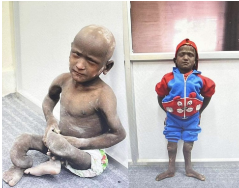
A young boy before and after surgery giving him a new and normal life.